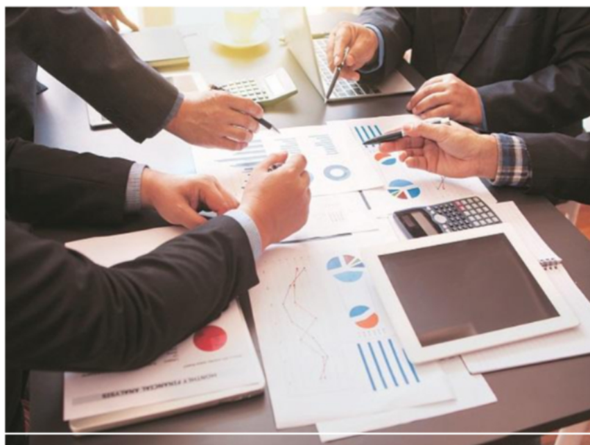
The number of stocks in these funds usually ranges from 20-30, much less than the typical 60 or more found in diversified peers